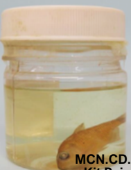
MCN.CD.018 Kit Peixes