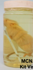
MCN.CD.009 Kit Vertebrata