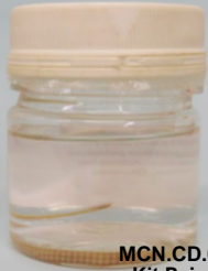
MCN.CD.012 Kit Peixes