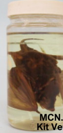
MCN.CD.010 Kit Vertebrata