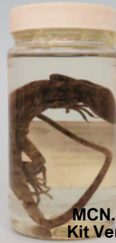
MCN.CD.006 Kit Vertebrata