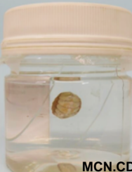
MCN.CD.025 Kit Mollusca