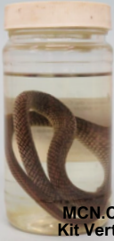
MCN.CD.007 Kit Vertebrata