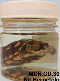
MCN.CD.306 Kit Herpetologia