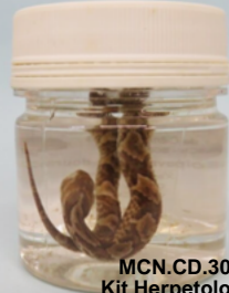
MCN.CD.308 Kit Herpetologia