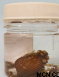
MCN.CD.028 Kit Mollusca