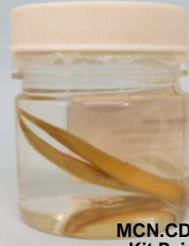
MCN.CD.014 Kit Peixes