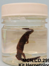
MCN.CD.299 Kit Herpetologia