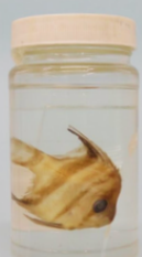
MCN.CD.001 Kit Vertebrata