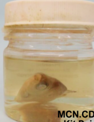
MCN.CD.020 Kit Peixes