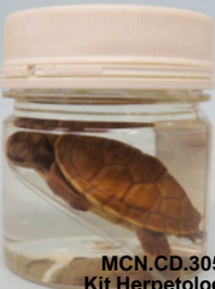
MCN.CD.305 Kit Herpetologia