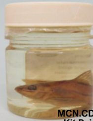
MCN.CD.013 Kit Peixes