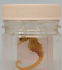
MCN.CD.002-B Kit Peixes