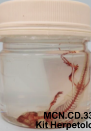
MCN.CD.332 Kit Herpetologia