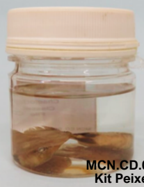
MCN.CD.011 Kit Peixes