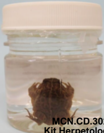
MCN.CD.302 Kit Herpetologia