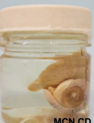
MCN.CD.027 Kit Mollusca