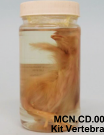
MCN.CD.008 Kit Vertebrata