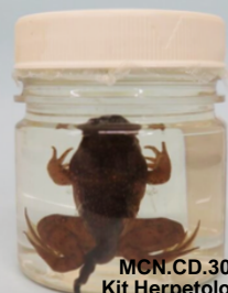
MCN.CD.303 Kit Herpetologia