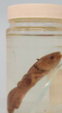
MCN.CD.004 Kit Vertebrata