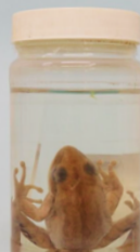
MCN.CD.003 Kit Vertebrata