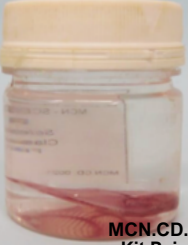
MCN.CD.021 Kit Peixes