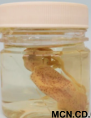
MCN.CD.024 Kit Mollusca