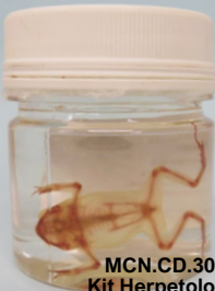
MCN.CD.300 Kit Herpetologia