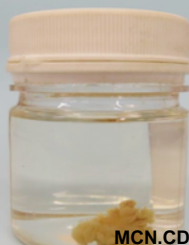
MCN.CD.026 Kit Mollusca