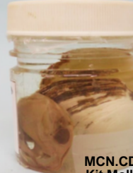
MCN.CD.023 Kit Mollusca