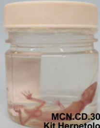
MCN.CD.307 Kit Herpetologia