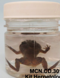
MCN.CD.301 Kit Herpetologia