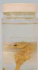
MCN.CD.002-A Kit Vertebrata