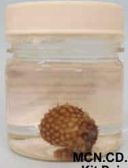
MCN.CD.015 Kit Peixes