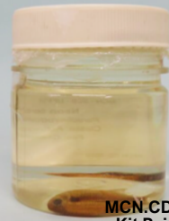
MCN.CD.016 Kit Peixes