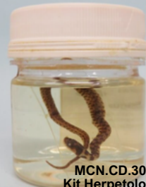
MCN.CD.309 Kit Herpetologia