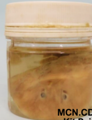
MCN.CD.019 Kit Peixes