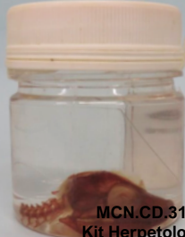
MCN.CD.310 Kit Herpetologia