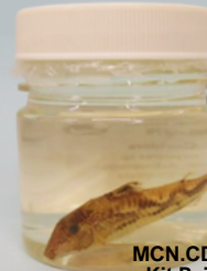
MCN.CD.017 Kit Peixes